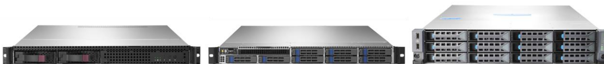
FIGURE 2: HP CLOUDLINE CL1100, CL2100, & CL2200

HP Cloudline servers do not come with HP ProLiant features such as iLO, Smart Array, OneView, HP SmartMemory, or SmartDrives, since large service providers generally do not need or want to pay for these features. HP Cloudline servers are equipped with IPMI (Intelligent Platform Management Interface) for basic hardware monitoring and remote management systems. IPMI is widely used by large service providers as a baseline for their management tools and practices and should simplify integration of new Cloudline servers into their existing datacenter environments. In addition, HP offers a range of service and support contract options for Cloudline dependent on the service provider’s requirements.